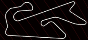
YAS Marina Circuit